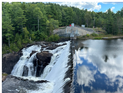
High Falls Dam in Saranac