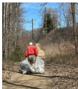
Quite the collection