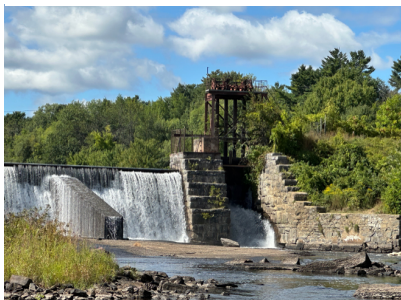
Imperial Mill Dam in Plattsburgh during the peak of the summer drought

The Saranac River offers scenic vistas all along the corridor along with recreational activities such as fishing. Feel free to explore ... and gain the peace and tranquility that it readily offers.