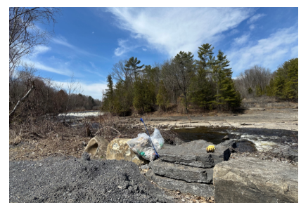
Taking a break to admire the scenery ...