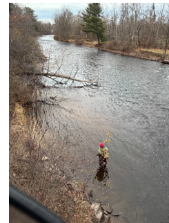
Fishing the Saranac River