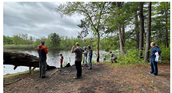
In May, Board members and friends walked along the Saranac River on the Blue Trails in SUNY Plattsburgh Rugar Woods.

The Trail Walks & Talks or Drives & Talks provide opportunities for the Board and friends to explore future SRT Greenway routes and introduce them to others. Participants describe them as "relaxing, fun, good exercise, a great way to visualize what the greenway can look like." These outings keep all of us excited about building the Greenway one mile at a time!