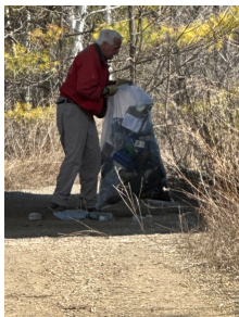
One bag at a time ...