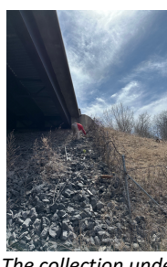
The collection under the I-87 overpass